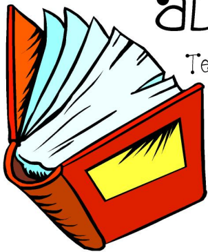
Text to text

to connect what you read to your life. It may have happened to you, a friend, or you may have read about it somewhere else.