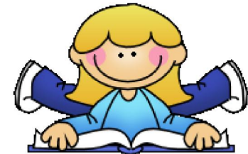
text to self